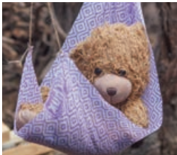
My teddy bear got really dirty in all the dust, so my Leader said he had to have a wash.

We are from Sri Lanka and camping with Australian Scouts. We were nervous about staying with them in the beginning but time passed and we became friends. We just love to camp with them, and we are a bit sad that the camp will be ending within two days and we have to return to our home country.