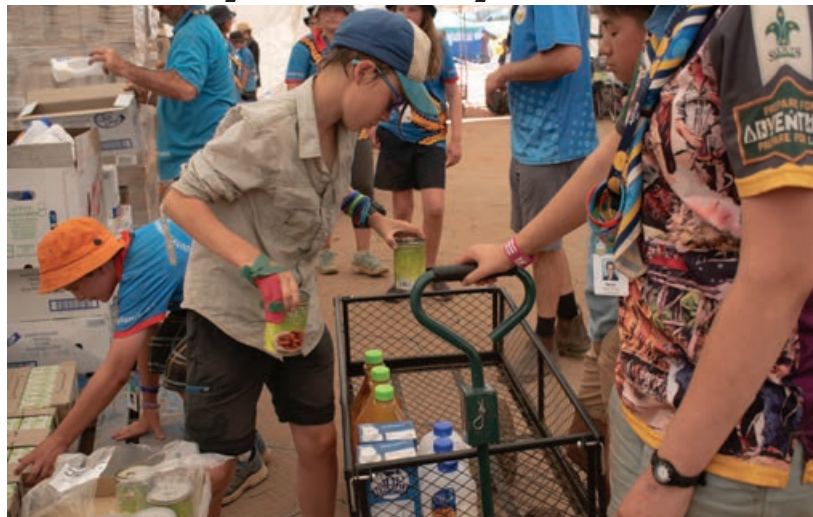
A Patrol from D536 collecting the all important baked beans.