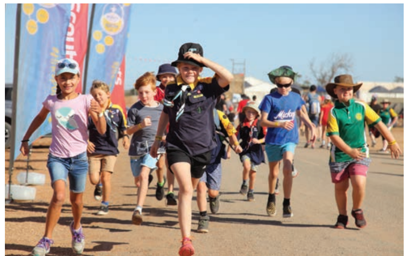
Watch out! Future Scouts from all over Australia have arrived to take over AJ2019. The first of the thousands of excited Cubs and other future Scouts rushed through the gates at 9 am today.