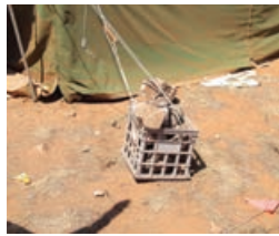
Innovative tent pegging required at AJ2019.

In C442, Gemma tells the tale of the Pineapples Patrol and what happened at breakfast. "We were cooking spaghetti on the stove, and the pot was hot so a Patrol member held onto the pot with a tea towel while they stirred the spaghetti. But suddenly the tea towel caught on fire because it was dangling too far down the side of the pot. Quickly, we threw the tea towel to the ground and stood on it to put the flames out. Fortunately we didn't need the fire blanket or extinguisher located nearby.