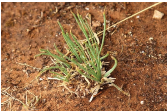
GET OFF MY LAWN. A rare patch of grass has been found on site C211 in a location they wish to keep secret for obvious reasons. The grass has been placed under 24hr guard to ensure its survival from all the feet wishing to walk on it.