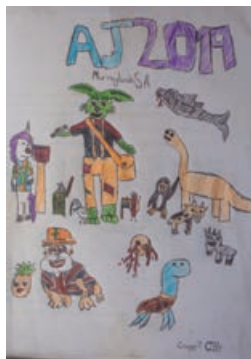
My drawing including the bunyip and lots of different Troop badges. Cooper, C554