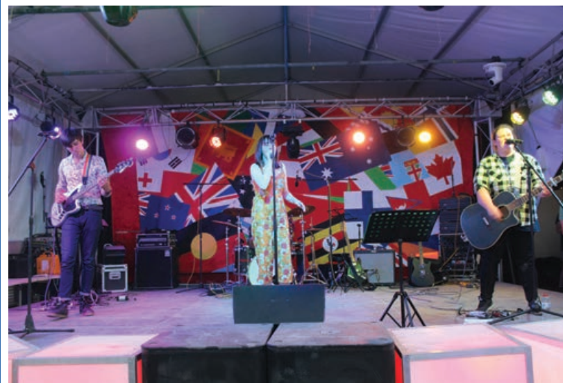
Some fun with Family Feud followed by the Murray Bridge Advanced Band Connection