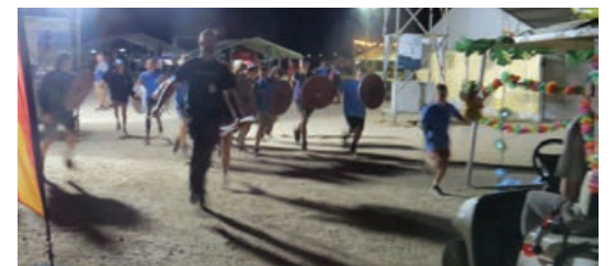
D540 Vikings: "Surround the late running buggy for plunder!"