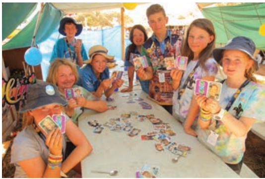
D539 came up with the idea of a packet of playing cards for each troop member as a souvenir and free time activity - except these cards have the faces of different Troop members on each card.