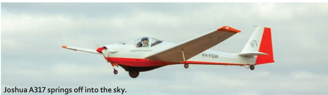
Joshua A317 springs off into the sky.