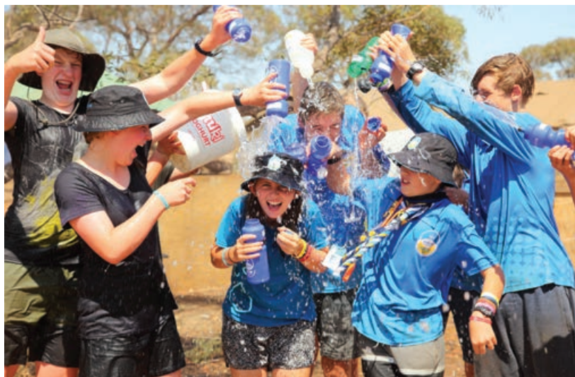
D752 thought it would be a good idea to cool off by pouring water onto their Patrol Leaders.