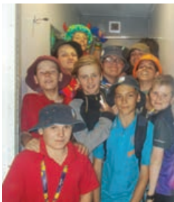
How many Scouts can you fit in a shower? According to A105 and A212, the answer is 20!