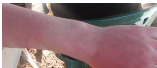
Jamboree sunburn! A UK Scout from D648 finds out wristbands create a weird tan line.