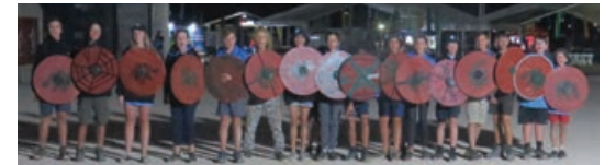
D540 Vikings preparing to attack, "Shield wall"