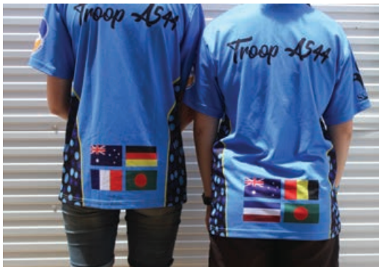
In our Troop we have people from four different countries, Germany, France, Bangladesh & Australia. We decided to put our flags on our shirts but the designers obviously didn't know much about flags. They put the Belgian flag instead of the German, and the Netherlands instead of the French flag.