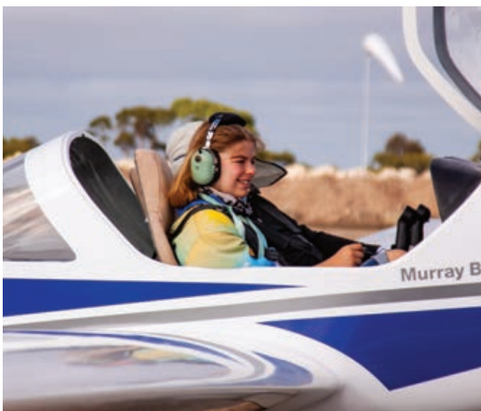
Clare C767 excited at the amazing views of AJ2019 from the sky.