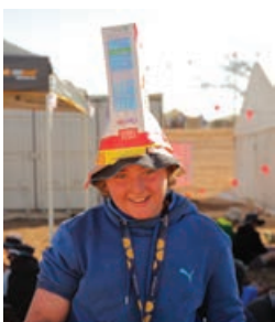
Sol of C441 is on Duty Patrol today, and decided to wear a cereal box for the day.