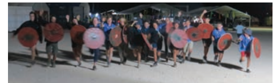
D540 Vikings attack!