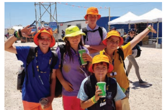
The Orange Hat Brigade of B217 - they're hard to miss!