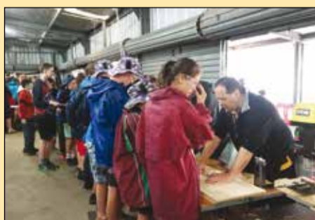
A230 – preparing to make lights

Plenty of action in 'The Shed' for the QLD Contingent where they learnt life skills: