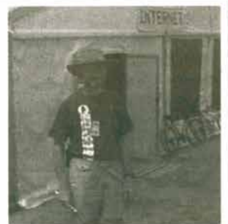
It's not hard to find the internet activities; just follow the roar of the ocean

So if your not doing anything of reasonable importance during the evening or your practically bored, try the Internet facility at the Global Village and see what you can find.