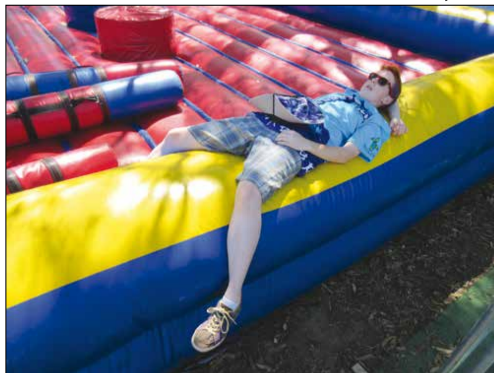
Jamboree Idle: This Rover found a shady place to catch a few zzzz's while taking a break.