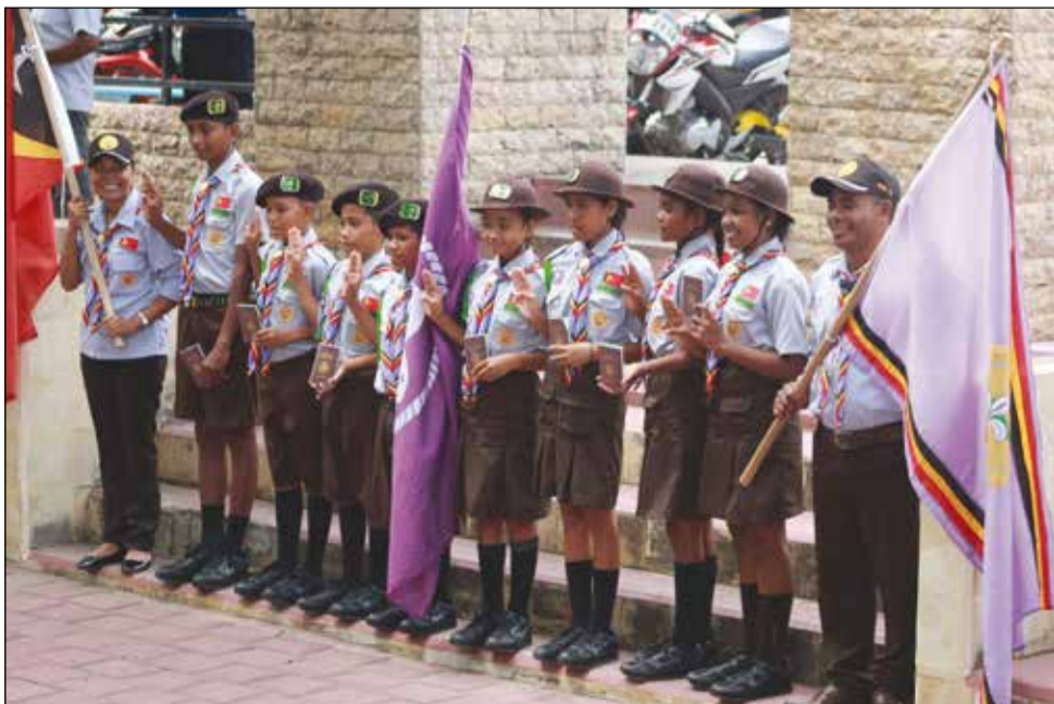
Timor-Leste Contingent to AJ2016 departing Dili. Sponsored by Scouts Australia and 1st Haberfield Scout Group, NSW